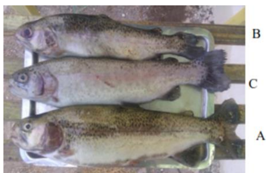
Figure 1: Color change of rainbow trout skin fed by safflower (A: 10% treatment, B: 15% treatment, C: 5% treatment).

Regarding skin discoloration, the results of Table 2 showed that statistically, the treatment of 10% safflower on the factors of redness, yellowing, and L* or skin brightness was significantly different from other treatments ( p \leq 0.05 ) (Figs. 1 and 2). According to the results of Table 2, in relation to scarlet firethorn; fillet brightness index (L*), fillet red/green index (a*), Fillet yellow/blue index (b*), skin brightness index (L*), red/green skin index (a*) and yellow/blue index Skin (b*) was not affected by different treatments ( p < 0.05 ).