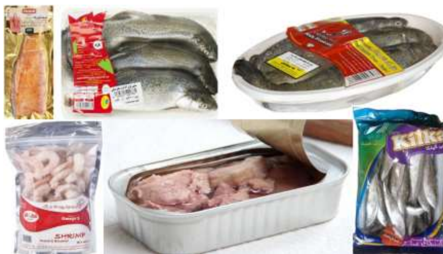
Figure 3: Some examples of packaging forms for fish and fishery products.

Size and weight (with effect coefficient of 0.21), material (with effect coefficient of 0.15) and shape and form (with effect coefficient of 0.11) of fishery products packaging were in next ranks of influence, respectively. Probably due to effect size and weight of packaging of fishery products on price, it may affect the consumers and buyers' attitude toward packaging. The first priority of people to buy packaged shrimp was 250 to 500 grams (Reyhani Poul et al. , 2019b). The choice of size of fishery products by the people depends on the household population, type of product and amount of income. The packaging material of fish and fishery products affects the consumers and buyers' attitude toward packaging, probably due to hygiene issues. The proper shape and form of packaging leads to attractiveness of the product and probably for this reason it affects consumers and buyers' attitude toward packaging. Figure 3 shows some examples of packaging forms and shapes for fish and fishery products.