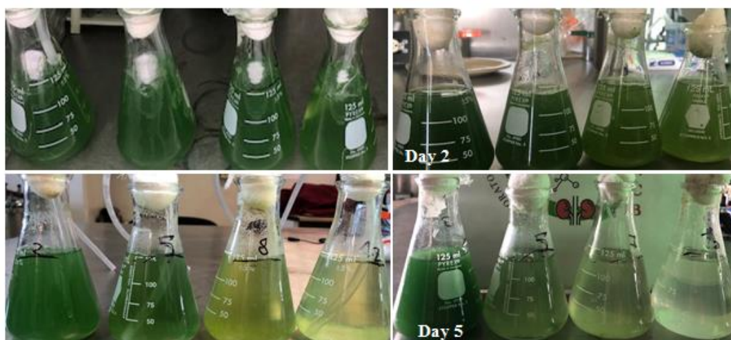
Figure 3: Changes in medium's color during cultivation day (from right to left show four different concentrations of ammonium sulfate of 0, 1.25, 2.5 and 5 gL -1 , respectively)

The changes in final cell dry weight and nitrogen-cell conversion factors related to nitrogen sources at different concentrations are presented in Table 2. Variations in the ammonium sulfate concentrations did not show a significant difference in a pattern throughout the growth and the cell dry weight values. The final cell dry weight of treatment 9 was the lowest when ammonium was only twice higher than the control concentration (2.5 gL -1 ) of the total nitrogen. According to Table 2,