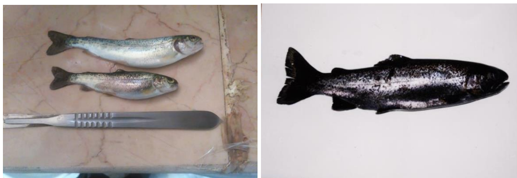
Figure 1: Clinical signs of infected fish.

Iran in 2018. Also, infected fish were collected with clinical symptoms such as darkening skin, external hemorrhages and internal bleeding in liver, kidney and skin or combination of these symptoms (Fig.1).