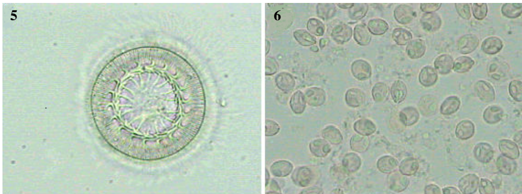
Figure 5: Trichodina sp. (X 186)