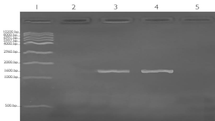
Figure 2: PCR diagnosis for Aeromonas hydrophila bacteria which examined through agarose gel electrophoresis (1%) under UV light. Lane 1: DNA Ladder (500-10200bp), Lane 2: negative PCR control, Lane 3: positive PCR control, Lane 4: positive bacterial sample, Lane 5: negative bacterial sample.

were finally confirmed by PCR diagnosis, for that purpose special primers have been designed for aerolysin gene as described in the methodology section. Agarose gel electrophoresis (1%) was conducted for PCR product and amplicons with 1479 bp confirmed the presence of Aeromonas hydrophila as shown in figures 2 and 3. The PCR test result is shown in Table 4.