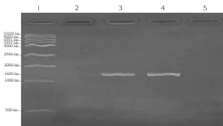
Figure 2: PCR diagnosis for Aeromonas hydrophila bacteria which examined through agarose gel electrophoresis (1%) under UV light. Lane 1: DNA Ladder (500-10200bp), Lane 2: negative PCR control, Lane 3: positive PCR control, Lane 4: positive bacterial sample, Lane 5: negative bacterial sample.

were finally confirmed by PCR diagnosis, for that purpose special primers have been designed for aerolysin gene as described in the methodology section. Agarose gel electrophoresis (1%) was conducted for PCR product and amplicons with 1479 bp confirmed the presence of Aeromonas hydrophila as shown in figures 2 and 3. The PCR test result is shown in Table 4.