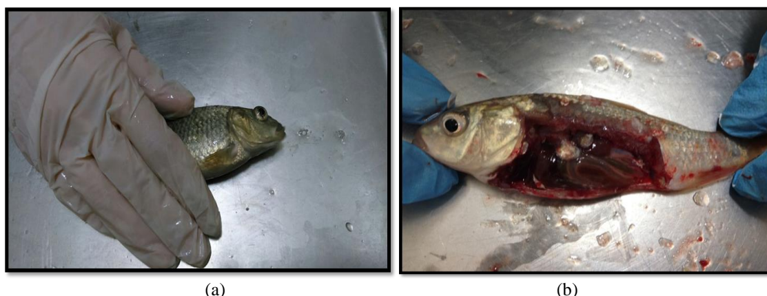
Figure 1: Some clinical signs have been observed in dead fish due to SVCV infection (a, b).