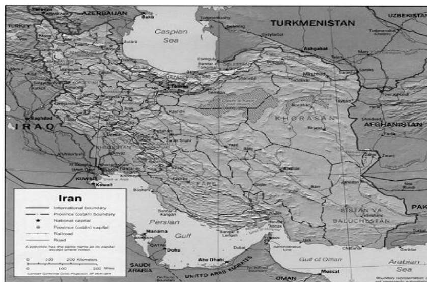
Figure 1: Coastline length at the north and south of Iran

best ideas for fisheries issues. Conventional research methodologies are often costly, take a longer time to accomplish and require the services of experts. Hence, practitioners are continuously developing applied research methodologies that: (1) are cost-effective; (2) can quickly generate information; (3) maximize the participation of concerned stakeholders; and (4) produce relevant results to managers and politicians (Garces et al., 2010). Hence, we use a different methodology to be more effective and reliable. In order to do this, two different methods of SWOT and VE were used in this work. Field study, implementation and analysis of different phases were also discussed.