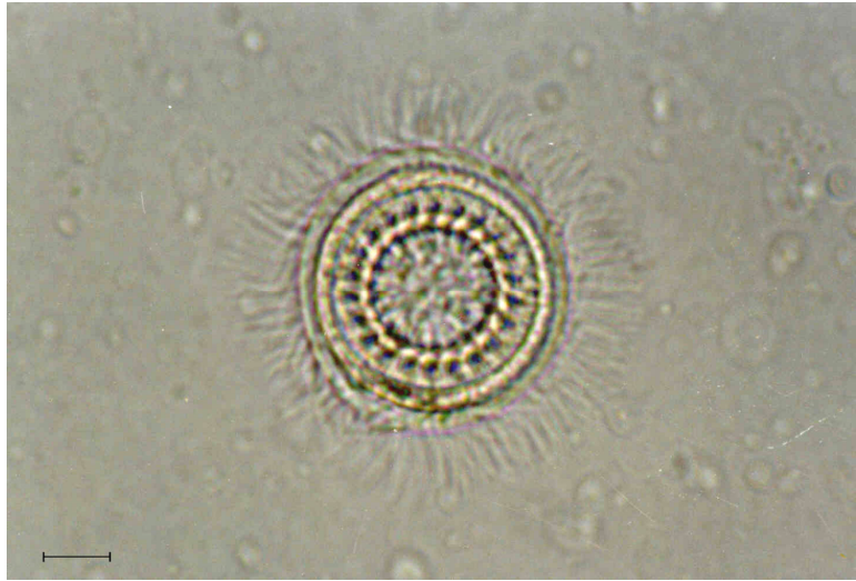
Figure 3: T. reticulata (X746), scale bar 10 \mu m