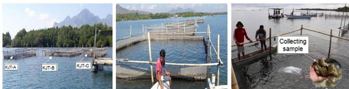
Figure 1: Sea pens (KJT) used for sea cucumber rearing.

water discharged from intensive shrimp ponds that could affect the characteristics of seafloor sediment. The three 10 \times 5 \text{ m}^2 sea pens (KJT), namely KJT-A, KJT-B, and KJT-C, with a 3-m height net, were installed at the site using bamboo and plugged into the seabed to support the net. Nylon nets with a mesh size of 5 mm were used, and its lower edge was held using a bamboo frame. The net was fitted to the seafloor, buried to a depth of 20 cm, and pressed tightly using a sand-sack weight to prevent sea cucumber from escaping (Fig. 1). Before the seeds were stocked, predatory animals inside the pen such as crabs and starfish were removed.