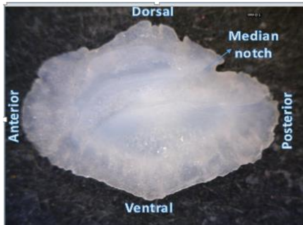
Figure 3: Sagittal otolith of Acanthopagrus arabicus (Iwatsuki, 2013).

Morphometric parameters including: otolith length, otolith width, area, and perimeter were measured using Digimizer Software to calculate shape indices (Table 1). Form factor is a parameter to estimate irregularity of surface area. Aspect ratio is the ratio of otolith length to otolith width. Roundness and circularity gives information on the similarity of various features with regard to a perfect circle, and ellipticity indicates whether the changes in the axes are proportional. Rectangularity describes the variations in length and width with respect to the area (Tuset et al. , 2003).