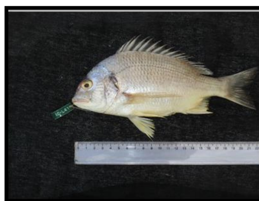
Figure 2: Acanthopagrus arabicus .

Collected species from 125 random stations were preserved in ice boxes and transferred to the laboratory for further biological measurements and otolith investigations. Identification and separation of genus and species of samples were done by using FAO keys (Fig. 2). Standard length of each specimen was measured to the nearest mm (Carpenter et al. , 1997; Iwatsuki, 2013).