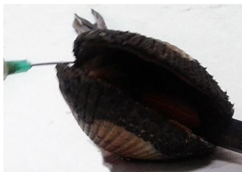
Figure 1: Blood cell sampling from Anadara antiquata .

The blood samples were taken from the posterior and anterior adductor muscle, using a sterile syringe with a 25-gauge needle according to the procedure of Lowe and Pipe (1994) (Fig. 1).