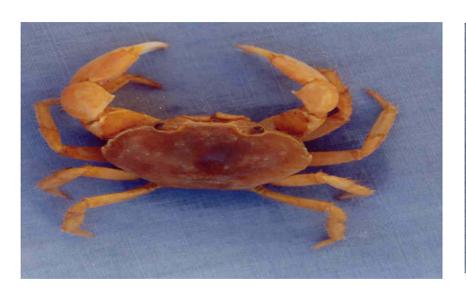
Figure 8: Eurycarcinus orientalis Length, 48mm