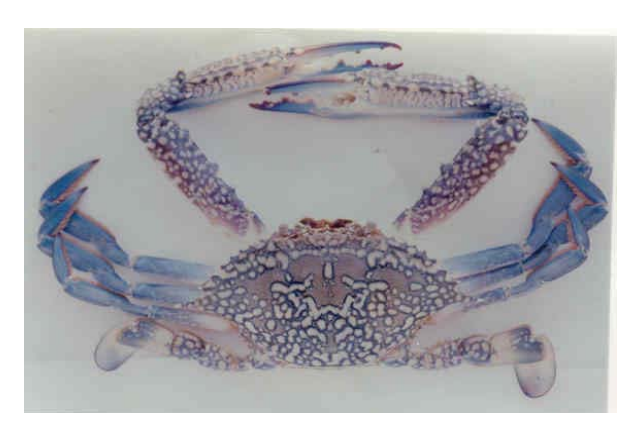
Figure 4: Portunus pelagicus Length, 180mm