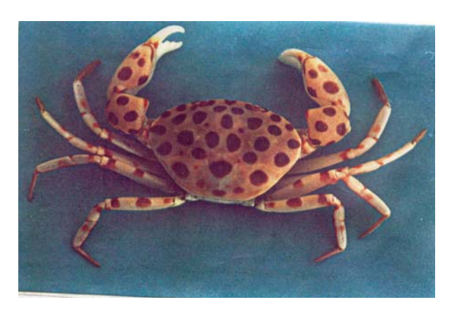
Figure 5: Portunus sanguinolentus Length, 170mm