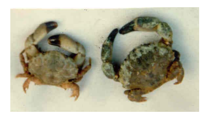
Figure 3: Pilumnopeus vauquelini Length, 50mm

In total, 12 species including 1 alpheid shrimp (Alpheidae) 2 Porcellanidae and 1 Diagonidae (Anomura), 2 Xanthidae, 2 Portunidae, 1 Grapsidae, 1 Pilumnidae, 1 Ocypodidae, 1 Carpiliidae (Brachyura) were found in this survey. It seems that most species show affinity to East Indian and west Pacific Ocean decapods. Only one of them, namely ( P. persica ), is endemic to the north part of the Persian Gulf and Oman Sea.