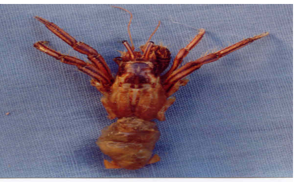
Figure 9: Clibanarius signatus Length, 6mm