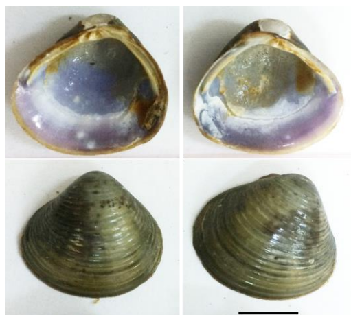
Figure 1: Photos of Corbicula fluminea . Scale bar: 1 mm.

Heavy metals in clam's tissues were extracted as previously reported by Yap et al. (2003) with minor modifications. Briefly, soft clams tissues were homogenized in 2 mL of concentrated nitric acid (75%). After sonication for 3 min, the samples were completely digested with 2 mL of the same solution for 12 h at 80°C. The digested samples were then centrifuged at 4000 rpm for 10 min under room temperature. The supernatant contained metals were kept at -20°C period to analysis.