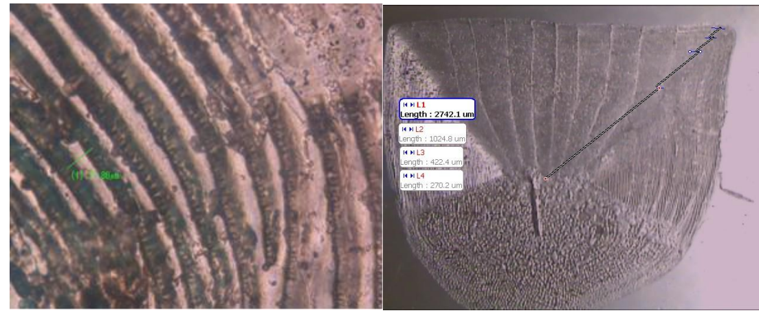
Figure 2: Measuring the distance of scale center to the annual growth rings (left) and the distance of growth rings in each annual areas (right).