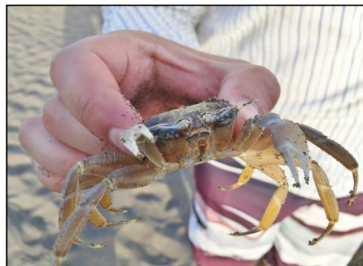
Figure 1: Ocypode cursor .

Excel'07 and Statistica'7 to reveal the statistical background. From the statistical results, standard deviation values and correlation matrices were used to test the hypothesis of study.