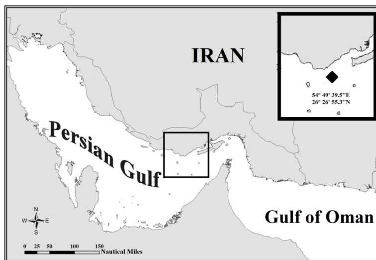
Figure1: Map of sampling location in the northern Persian Gulf.

morphometric measurements were taken using a dial caliper with an accuracy of 0.02 mm. The data were taken, and recorded based on Nateewathana (1997), Nateewathana et al. (2001) and Aungtonya et al. (2011).