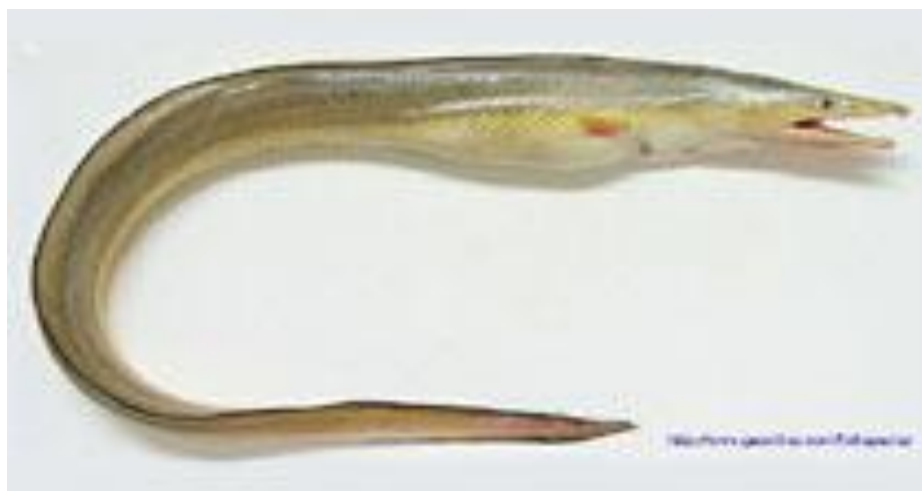
Figure 2: Conger esox talabonoides Ref. code: P, (Chau, 2003)

This sample collected from Meidani (Oman Sea) and Kept in Tehran University Zoology Museum (Ref. code: P), without scientific and museum codes (Tables 1, 2; Fig. 2).