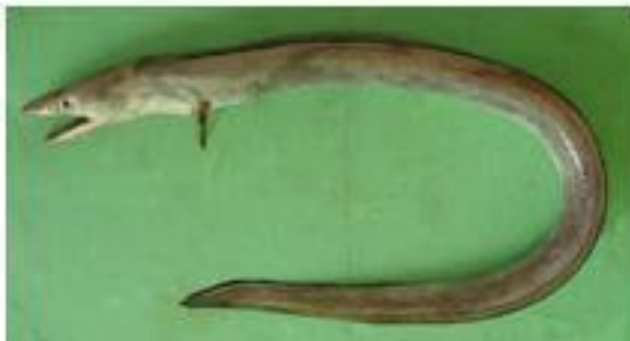
Figure3: Muraenesox Bagio Ref. code: E, (Owfi and Abbasi, 2007)

Muraenidae: Included 15 genera and 200 species, and 5 genera and 8 species identified from Muraninae subfamily.