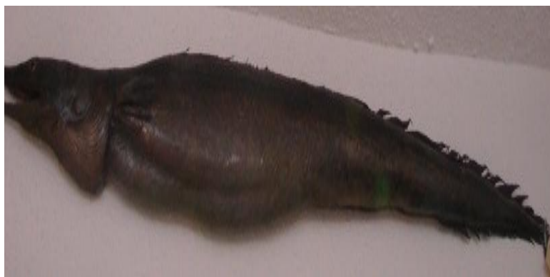
Figure 5: Synphobranchius affinis Ref. code: K, (Owfi and Abbasi, 2007)

Collected from Kish Island in coralline rocky habitats (Persian Gulf) and kept in Darabad Museum (Ref. code: K), without scientific and museum codes (Tables 1, 2; Fig. 5).