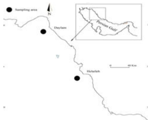
Figure 1: Sampling areas for P. semisulcatus in Bushehr coastal waters, Persian Gulf (2004)

A total of 50 P. semisulcatus were collected by R/V Lavar II from two major shrimp localities, Halaileh and Daylam (Fig. 1), in August and September 2004. Genomic DNA was extracted from muscles using the modified mini preparation method (Lie et al. , 1999). A set of 9 primers (Diotech MWG) were used to detect polymorphism among populations (Table 1). The software package RAPDistance (Armstrong et al. , 1994) version 1.04 was used to analyse the data.