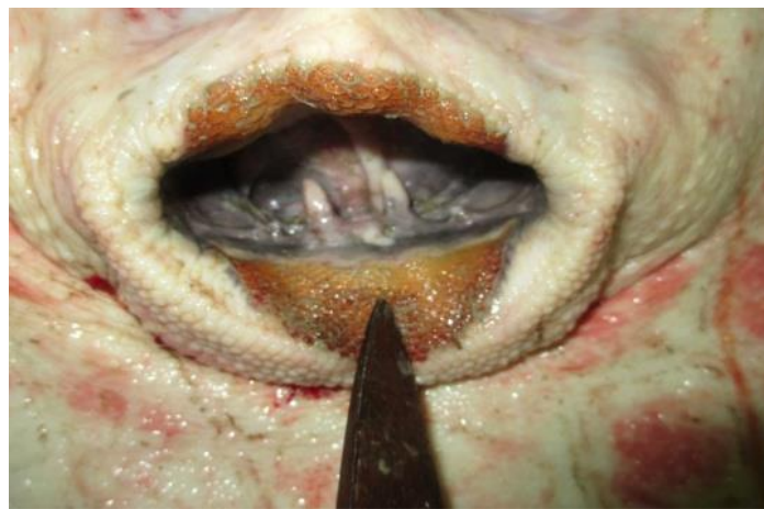
Figure 3: Teeth and two papillae on central floor of mouth in Himantura granulata from the Persian Gulf.

This species reaches a maximum reported size of 141 cm DW (without special point), size at birth and mature males are reported at 14-28 cm and 55-65 cm DW, respectively (Manjaji et al. , 2009).