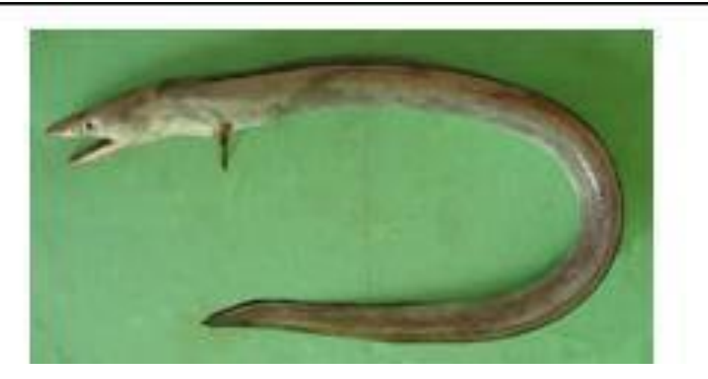
Figure3: Muraenesox Bagio Ref. code: E, (Owfi and Abbasi, 2007)

Muraenidae: Included 15 genera and 200 species, and 5 genera and 8 species identified from Muraninae subfamily.