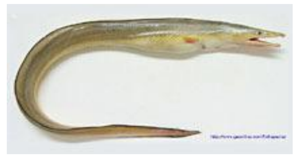
Figure 2: Congeresox talabonoides Ref. code: P, (Chau, 2003)

This sample collected from Meidani (Oman Sea) and Kept in Tehran University Zoology Museum (Ref. code: P), without scientific and museum codes (Tables 1, 2; Fig. 2).