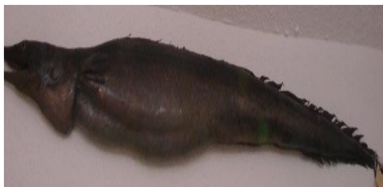
Figure 5: Synaphobranchus affinis Ref. code: K, (Owfi and Abbasi, 2007)

Collected from Kish Island in coralline rocky habitats (Persian Gulf) and kept in Darabad Museum (Ref. code: K), without scientific and museum codes (Tables 1, 2; Fig. 5).