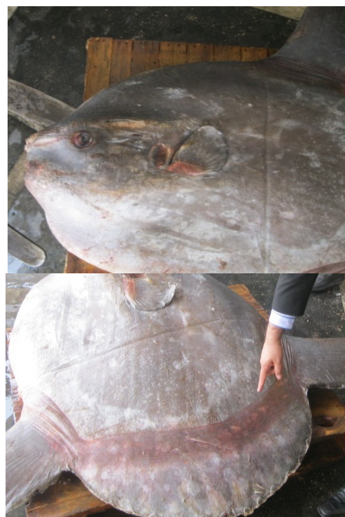
Figure 1: a) Mola ramsayi , 145 cm TL, caught in the Oman Sea, b) showing clavus

The geographical position of sampling area was 57° 31' E / 25° 31'N, about 17 nautical miles offshore.