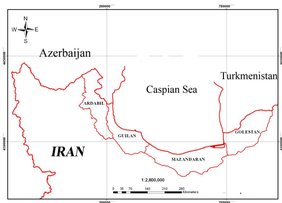
Figure 1: Sampling location in Caspian Sea

muscle samples (filleted and skinned) and liver tissue were dissected, washed in deionized water, weighed, packed in polyethylene bags and stored at -20 °C for further analyses.