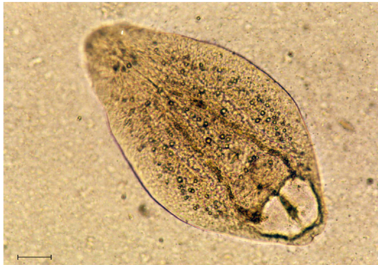
Figure 4: D. spathaceum (X373), scale bar 50 \mu m