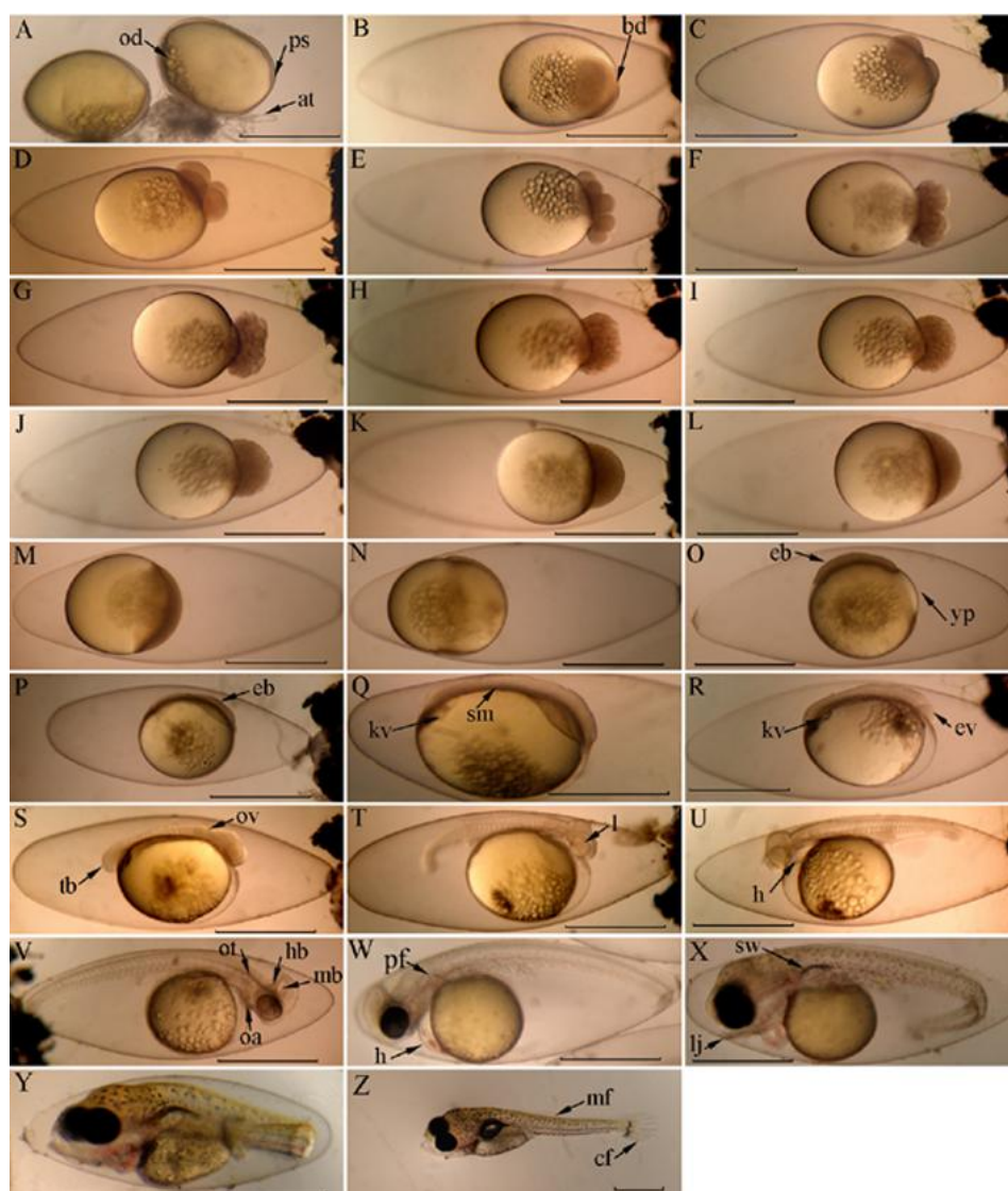
Figure2: Embryonic development of P. glenii at a temperature of 17-21 °C

attaching filament (at), blastodisc (bd), caudal fin (cf), embryonic body (eb), eye vesicle(ev), heart(h), hind-brain (hb), Kuffer's vesicle(kv), lens(l), lower jaw(lj), mid-brain (mb), membranous fin(mf), operculum anlage(oa), oil droplet(od), otoish (ot), otic vesicle(ov), pectoral fin(pf), perivitelline space(ps), swim bladder(sb), tail bud (tb), yolk-plug (yp). Scale bars indicate 1 mm.