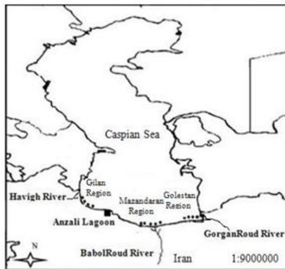
Figure 1: Map shows the sampling sites of Vimba vimba persa in the Iranian coastline

Iranian coastline of the Caspian Sea where this species migrates for spawning during spring (mid April to mid June), including 43 samples from Anzali Lagoon, 18 samples from Havigh River, 30 samples from BabolRoud River and 30 samples from GorganRoud River. The positions of these rivers are illustrated in Figure 1.