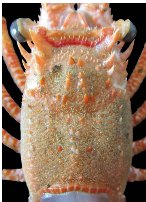
Figure 4: Dorsal view of carapace of P. waguensis from Oman.