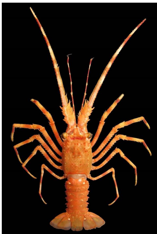
Figure 3: Palinustus waguensis , adult male, 43.1 mm CL, from the coastal waters of Oman.

Anterior margin of carapace between frontal horns bearing 5–7 spines (Fig. 4). Frontal horns truncated, with 5–7 distinct spines on inner margins. According to Holthuis (1991), the presence of several distinct spines on anterior margin of carapace as well as inner margin of the frontal horns are distinguished features of the species, while following Chan and Yu (1995) anterior margin of carapace between frontal horns provided with 0 to 8 spines and inner margin of supraorbital horn armed with 0–5 spines. Epistome armed with 3 to 5 spinules on the anteromedian margin. Antennal peduncle armed with many spines with one distinctly long spine on distal part. Carapace was heavily pubescent with rows of regular spines along lateral edges. Postorbital spine is shorter than