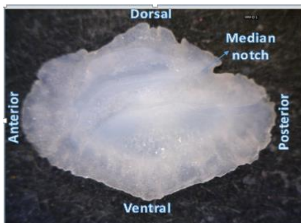
Figure 3: Sagittal otolith of Acanthopagrus arabicus (Iwatsuki, 2013).

Morphometric parameters including: otolith length, otolith width, area, and perimeter were measured using Digimizer Software to calculate shape indices (Table 1). Form factor is a parameter to estimate irregularity of surface area. Aspect ratio is the ratio of otolith length to otolith width. Roundness and circularity gives information on the similarity of various features with regard to a perfect circle, and ellipticity indicates whether the changes in the axes are proportional. Rectangularity describes the variations in length and width with respect to the area (Tuset et al. , 2003).