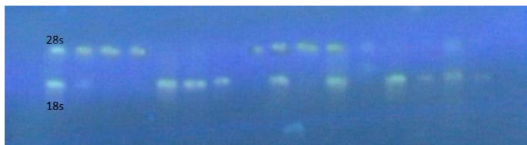
Figure 1: RNA quality assessment extracted from liver and muscle of H. huso on agarose gel (1.5%); in all samples two clear bands 18S and 28S of rRNA clearly observed (eight bands on the left are from liver and the others are from muscle).