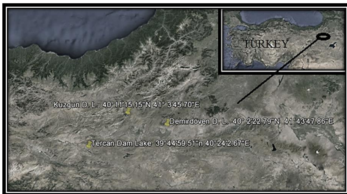
Figure 1: Locations of Kuzgun, Demirdöven and Tercan Dam Lakes.

Tercan Dam with an area of 9 km 2 and volume of 178 km 3 is one of the most important drinking, irrigation and energy resource of Erzincan that was built on Tuzla Stream during 1969-1988. Kuzgun Dam with an area of 11 km 2 and storage capacity of 312 hm 3 was built on Serçeme Stream between 1985-1986, for the purpose of irrigation and producing energy. Demirdöven Dam is a small dam with an area of 2 km 2 and volume of 34 hm 3 which was constructed on Tımar Stream for irrigation.