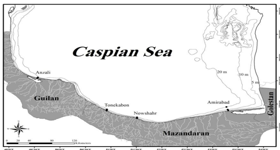
Figure 1: Map of the sampling stations in the Iranian coasts of Caspian Sea.