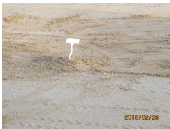
Figure 4: Marking nest for plot conduction, 2015.

To find the habitat variables effective in the selection of nesting regions of hawksbill turtles, some plots with dimensions of 10×10 square meters were established in the center of the nest after nesting so as to observe protective laws concerning this species; some habitat parameters within the nest boundary such as the width and slope of the beach, depth of the nest, determination of the type of the particles in the nest by soil sampling (Fig. 4), the distance of the nest to the nearest road, presence of seaweeds alongside the beach where egg laying is done along with water turbidity and the presence of the holes created around the nests by crabs were measured. A few kilometers away from the nesting regions and in different directions from the absence or control points, it was found that there was no trace of the hawksbill turtle at these points and the absence plots were established according to the number of the presence plots and the above habitat variables in these points were also measured to be compared with the presence points.