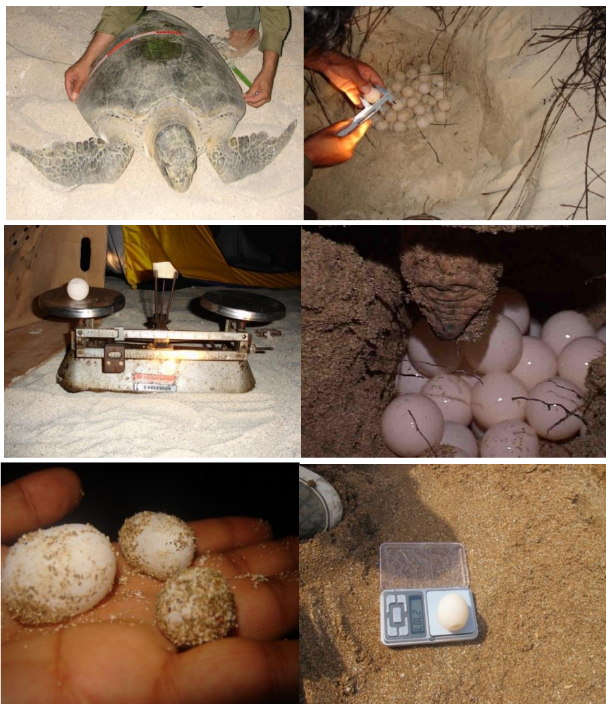
Figure 3: Biometry of hawksbill turtles and eggs in Hengam and Qeshm Islands, 2014 (photo by: A. Askari).

measured by a large caliper and plastic meter. The body weight was obtained by a spring balance with an accuracy of about 0.1 g (Fig. 3).