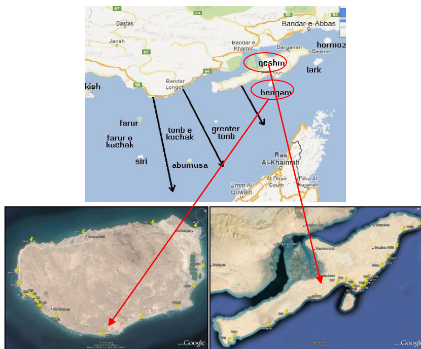
Figure 1: Qeshm Island (right) and Hengam Island (left).

square kilometers, and those of Qeshm Island are 26^{\circ} and 57' N latitude and 56^{\circ} 16' E longitude with an area of 1504 square kilometers in the south of Iran.