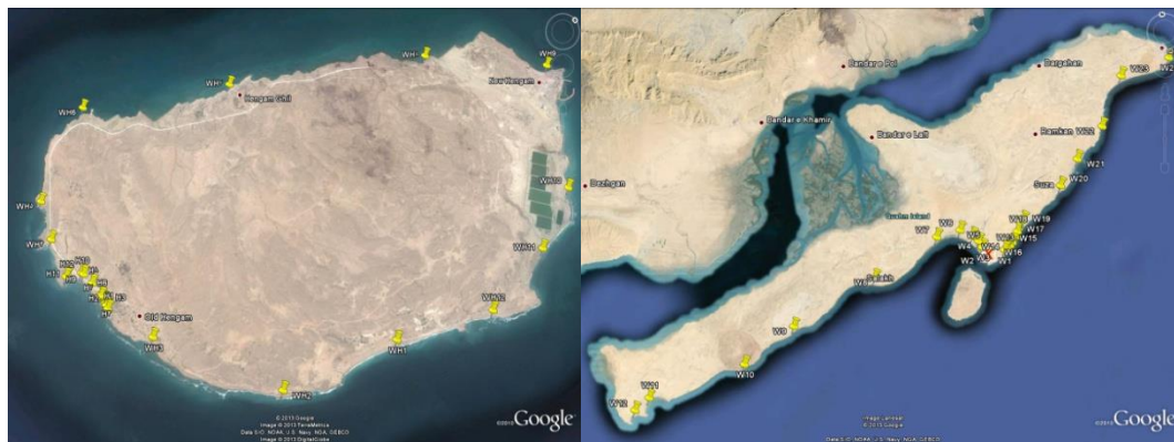
Figure 2: Location of nests of Hawksbill Turtles in Qeshm and Hengam.

After locating the nests, the biometry of the egg-laying female turtles was also performed and some parameters such as length and width of carapace were