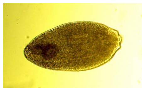
Figure 2: Microscope image of Diplostomum sp. metaserker (Original).

Front part of the body is leaf-shaped and the ventral part concave. The rear like a small conical shaped projecting from the posterior dorsal (Fig. 2). Usually there are a couple subsidiary organ called the lateral pull and there is no real parasite cysts.