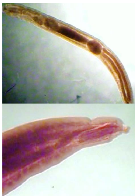
Figure 3: Microscope image of Neoechinorhynchus rutili (Original).

Body is generally bent towards the ventral, rear end thin (Fig. 3). Hose is too short and six rows with three hooks exist on it.