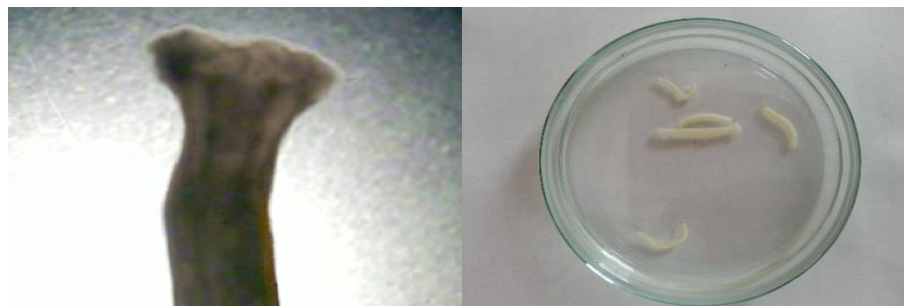
Figure 4: Microscope image of Khawia sinensis (Original).

are many and extending to the cirrus sac from back of skolex. Ovary 'H' shaped and puckered between the uterus and ovary cirrus sac (Fig. 4).