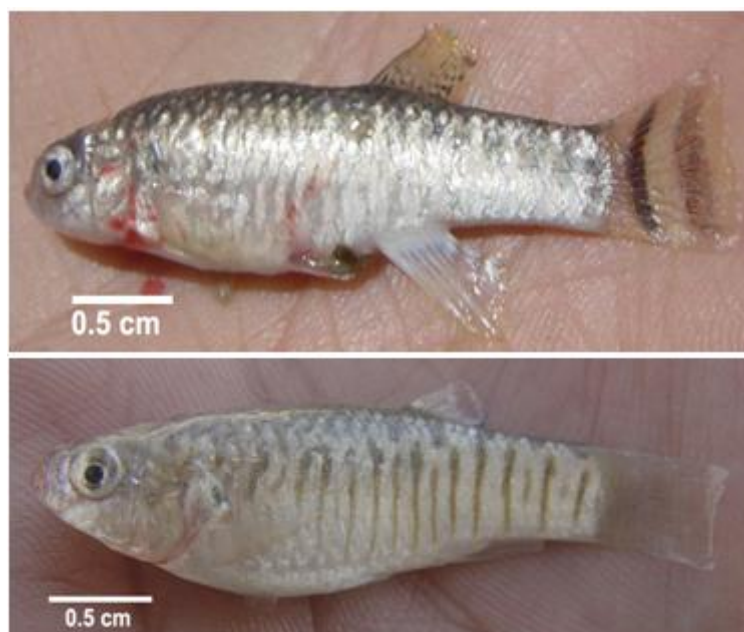
Figure 1: Photographs of male (with two dark caudal fin bars) and female Aphanius dispar in Mehran River, Hormuzgan province, south of Iran

From 63 dissected fish only two fish were infected with 4 and 3 parasites respectively and the others had only one parasite. The maximum and minimum of parasite lengths were 64.2 mm and 22.7 mm respectively. Also the maximum and minimum of parasite weights were 0.3 and 0.047 g respectively (Table 1). Mean parasite length and weight were 41.48 mm and 0.19 g respectively. Although the total length of male and female fish was not significantly different, the total length of parasites in male and female fish was significantly different ( P < 0.05 ). No significant difference was observed when the weight of male and female fish and their parasites were compared. The prevalence, intensity and abundance of infection by pleurocercoid of L. intestinalis were 22.22%, 1.36 and 0.3