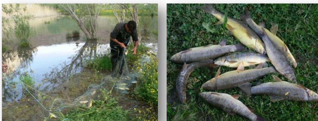
Figure 3: Catch of fishes by gill net.