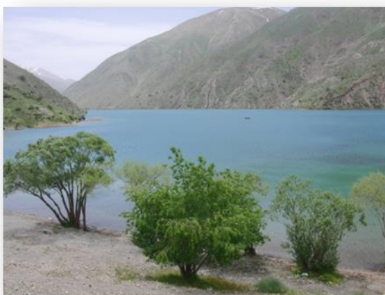
Figure 1: View of Gahar lake.

This research is the first report on Gahar Lake and Gahar River ichthyofauna and would contribute to the database required for conservation and sustainable utilization of Gahar Lake and Gahar River.