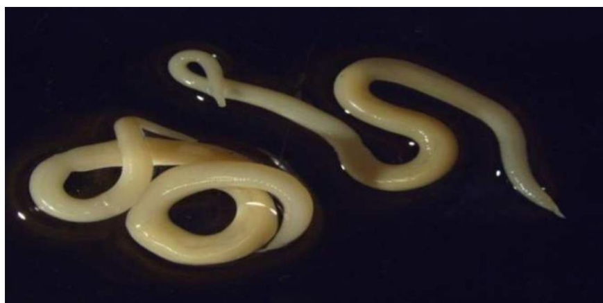
Figure 1: Macroscopic Hysterothylacium larvae isolated from the intestine of Scomberomorus commerson .

number 2736622. The evolutionary history was inferred by using the Maximum Likelihood method based on the Tamura-Nei model (Tamura and Nei, 1993). The tree with the highest log likelihood (-1719.1878) is shown (Fig. 3).