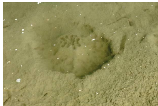
Figure 3: Nesting pattern of Iranocichla hormuzensis males on shallow bed margin of Tang-e-Khor River (Hormuzgan Province)

zigzag and were oblique) to attract females and specimens of females (in light color) were also seen around.