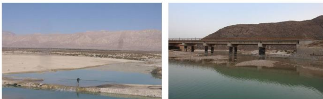
Figure 2: Study area in Tang-e-Khor River (Hormuzgan Province) (Left: view to south, Right: view to north)

Owfi et al. , 2014; Janparvar and Ghorbani Sepehrm, 2015) This study was carried out during field visits in March 2021 (Fig. 2).