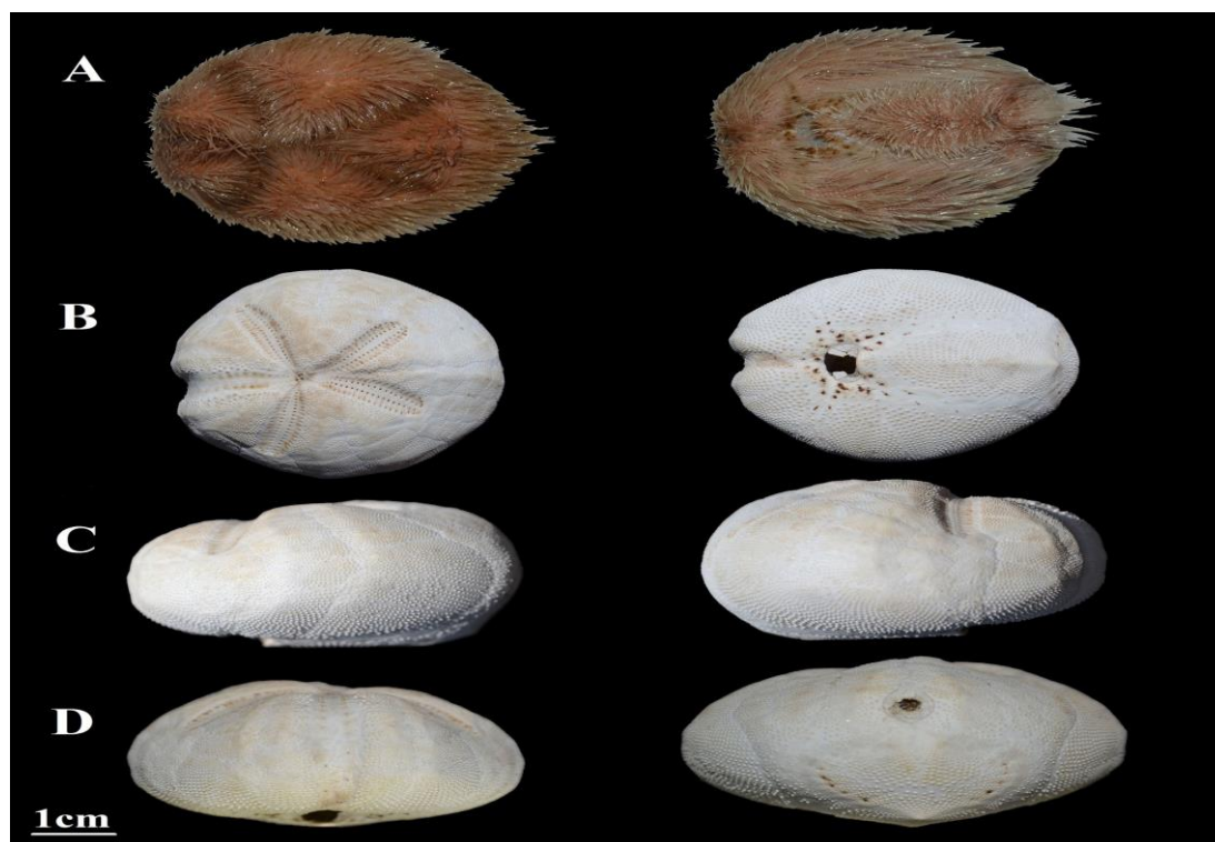
Figure 2: Metalia persica . A: Live specimen, B: Dorsal and ventral view, C: Lateral view, D: Frontal and distal view. Chabahar Bay, Iran.

fasciole. There are no anal fasciole. There are some enlarged tubercles along the frontal ambulacrum and frontal ambulacrum is rather sunken. Four genital pores are present. The shape of the peristome is semilunar and placed distinctly at anterior part of the test. Periproct is located posterior and enlarged upward (Fig. 2).