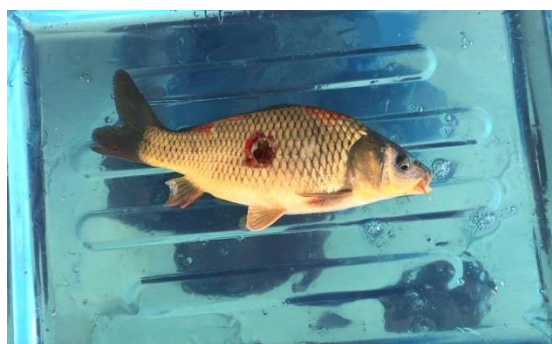
Figure 1: Ulcer and lesions on the skin of infected common carp.

First examination was done by viewing and observing for skin tissue change like ulcer and lesion formation on the skin, in mouth cavity and intestine, the result showed that out of 150 only 86 fish were infected with ulcer on their skin, only 6 fish had lesion around their mouth, and just 3 visceral organ lesions were present. The results are illustrated in Table 2.