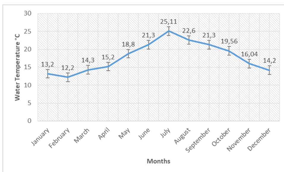
Figure 1. Average monthly water temperature changes in trial ponds in 2015-2016.

The average water temperature in the ponds was measured as 18.68 \pm 3.91^\circ\text{C} throughout the study. The lowest water temperature was recorded at 13.2^\circ\text{C} in January and the highest water temperature at 25.11^\circ\text{C} in July (Fig. 1).