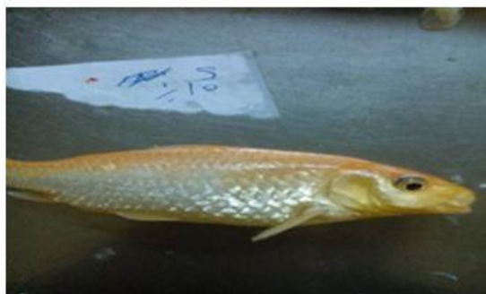
A.p. 7.5% diet