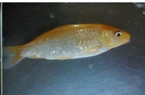
A.p. 10% diet