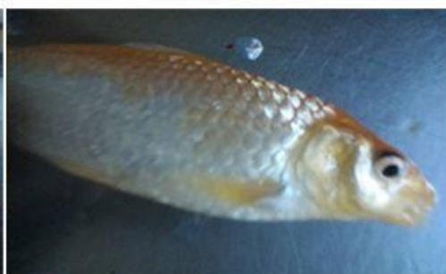
A.p 5% diet