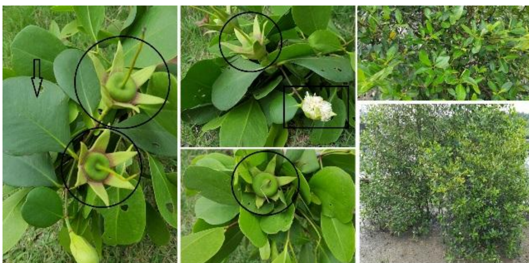
Figure 1: Sonneratia alba mangrove plant tree can be morphologically characterized by rounded leaf tips (arrow), corolla width flattened fruits (circles), and flower with white and small petals (rectangle).

Distilled water was used as a positive control. The agar diffusion discs experiments were prepared by soaking the pre-inoculated agar discs (6 mm in diameter) individually in different concentrations of 100 \mu l of S. alba extract. The discs were soaked in the extracts for one hour at 25°C. The treated discs were then washed three times in the distilled water and placed on the GP agar plates and incubated for seven days at 25°C. Mycelial growth of A. invadans was monitored daily for seven days. The antifungal activities of the extracts were evaluated by measuring the mycelial growth (mm) from the edge of the pre-inoculated discs on the GP plates. The boundary dilution without any visible growth was defined as the minimal inhibitory concentration (MIC) for A. invadans at the given S. alba extract concentrations. The filter paper disk diffusion method (Kohner et al. , 1994) was applied to compare the inhibition zone of S. alba