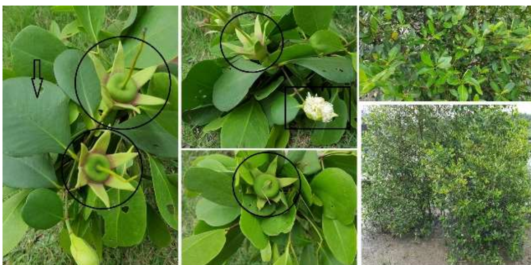
Figure 1: Sonneratia alba mangrove plant tree can be morphologically characterized by rounded leaf tips (arrow), corolla width flattened fruits (circles), and flower with white and small petals (rectangle).

Distilled water was used as a positive control. The agar diffusion discs experiments were prepared by soaking the pre-inoculated agar discs (6 mm in diameter) individually in different concentrations of 100 \mu l of S. alba extract. The discs were soaked in the extracts for one hour at 25°C. The treated discs were then washed three times in the distilled water and placed on the GP agar plates and incubated for seven days at 25°C. Mycelial growth of A. invadans was monitored daily for seven days. The antifungal activities of the extracts were evaluated by measuring the mycelial growth (mm) from the edge of the pre-inoculated discs on the GP plates. The boundary dilution without any visible growth was defined as the minimal inhibitory concentration (MIC) for A. invadans at the given S. alba extract concentrations. The filter paper disk diffusion method (Kohner et al. , 1994) was applied to compare the inhibition zone of S. alba