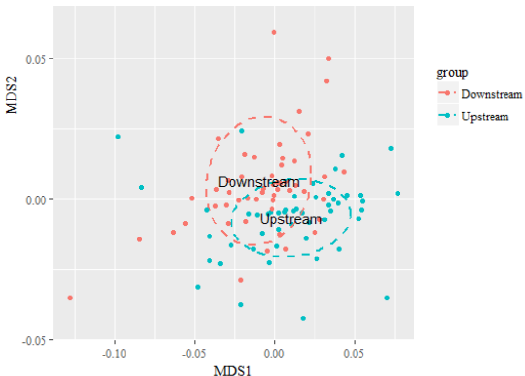
Figure 1: NMDS analysis between upstream and downstream populations showing the effect of ordination dispersion in population differentiation.

Significant codes: 0 '***' 0.001 '**' 0.01 '*' 0.05