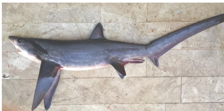
Figure 2: Alopias superciliosus caught by the swordfish longline in the Gulf of Antalya.