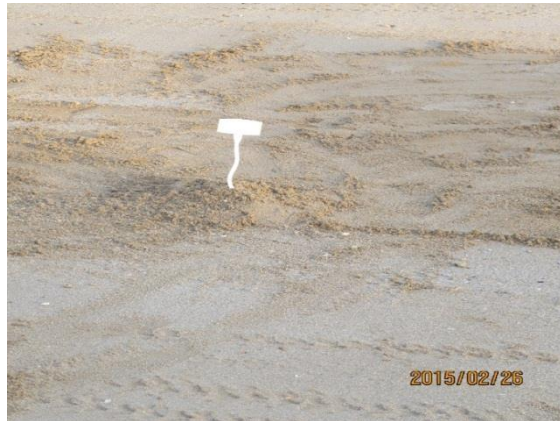
Figure 4: Marking nest for plot conduction, 2015.

To find the habitat variables effective in the selection of nesting regions of hawksbill turtles, some plots with dimensions of 10×10 square meters were established in the center of the nest after nesting so as to observe protective laws concerning this species; some habitat parameters within the nest boundary such as the width and slope of the beach, depth of the nest, determination of the type of the particles in the nest by soil sampling (Fig. 4), the distance of the nest to the nearest road, presence of seaweeds alongside the beach where egg laying is done along with water turbidity and the presence of the holes created around the nests by crabs were measured. A few kilometers away from the nesting regions and in different directions from the absence or control points, it was found that there was no trace of the hawksbill turtle at these points and the absence plots were established according to the number of the presence plots and the above habitat variables in these points were also measured to be compared with the presence points.