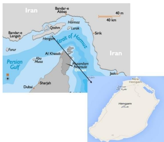
Figure 1: Geographical situation of sampling location in Hengam Island.

identification was done based on scanning optical microscope, skeletal slides and dissociated spicule mounts based on Hooper identification key (Hooper and Van Soest, 2002).