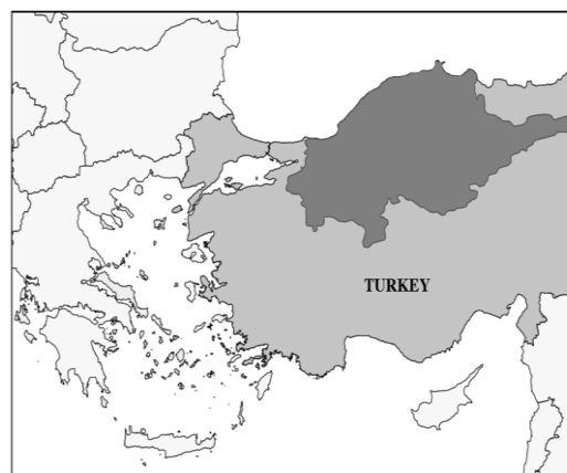
Figure 1: Distribution areas for Capoeta baliki , Capoeta sieboldii and Chondrostoma angorense (dark grey area) as reported by Freyhof (2014a,b,c) (modified).

their distribution range. Currently, there are no data on the population trends of these two species but it is suspected to be slowly declining (Freyhof, 2014 a, b).