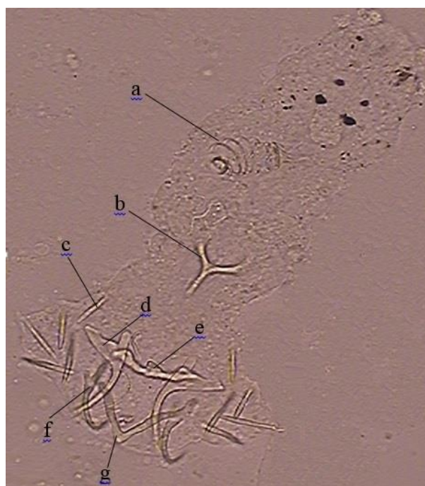
Figure 1: Gonocleithrum cursitans ; a: copulatory complex, b: gonadal bar, c: hook, d:Ventral anchor, e: Ventral bar, f: Dorsal anchor, g: Dorsal bar.400X.